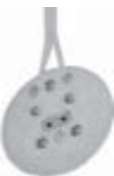
Mini 2-pin MR-16