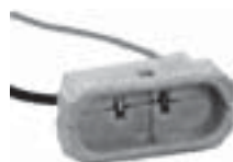
Mogul End Prong